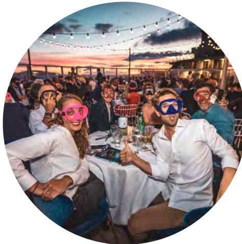
The Ocean Gala, June 8th, 2022