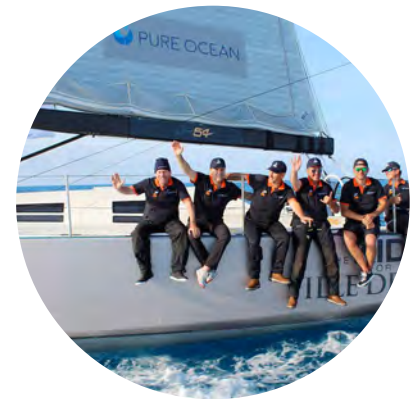
The Bermuda Lorient - Pure Ocean Challenge, May 2022