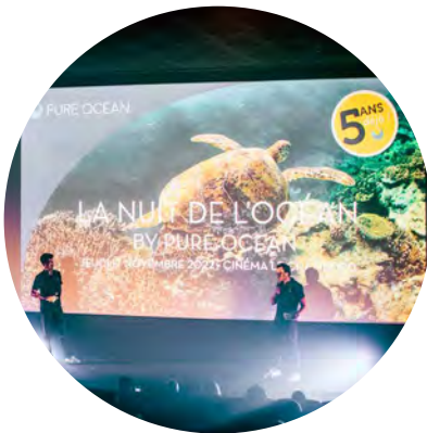
The Night of the Ocean 3rd edition - November 2022

For Pure Ocean, sport is a great vehicle for raising awareness about the ocean. The NGO supports races and sporting challenges, amongst which are the Race for Pure Ocean , exceptional races carried out by exceptional athletes, alone or in teams, who want to give meaning to their sporting performance. These events generate significant media coverage, reaching as many people as possible in the general public.