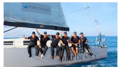
Bermudes Lorient - Défi Pure Ocean, May 2022

For Pure Ocean, sport is a great vehicle for raising awareness about the ocean. The NGO supports races and sporting challenges, amongst which are the Race for Pure Ocean , exceptional races carried out by exceptional athletes, alone or in teams, who want to give meaning to their sporting performance. These events generate significant media coverage, reaching as many people as possible in the general public.