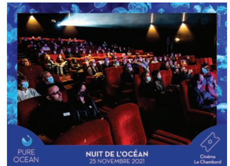
“La Nuit de l’Océan”, 2nd edition - November 2021. An exceptional evening with 190 guests, testimonials from committed athletes and scientists leading innovative projects